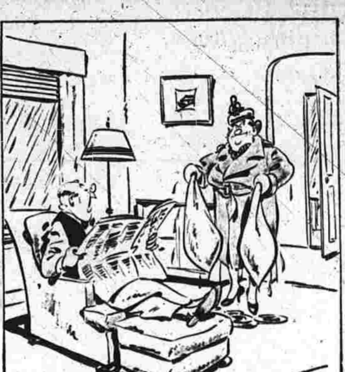
SWEETIE PIE BY NADINE SELTZER